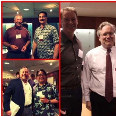
ABC members at the Summer Meeting

ABC also held the bi-annual ABC Human Resources & Training/Development Workshop in San Antonio, Texas, hosted by the South Texas Blood and Tissue Center, and discussed such topics as emotional intelligence, performance management, and customer service training. ABC also held the 2016 ABC IT Workshop in Minneapolis, Minn. Hosted by Innovative Blood Resources, the IT workshop brought professionals in the information technology industry together from across the nation to learn, discuss, and most importantly network with their peers.