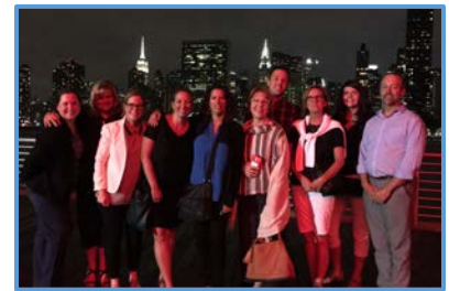
ADRP & ABC Members meeting in NYC

After the ABC Board of Directors Meeting in Chicago, we announced ADRP would join our association as an international division of ABC. This partnership continues to bring together two organizations committed to providing educational opportunities for professionals involved in all aspects of donor recruitment, experience, and management, both nationally and internationally. We are looking forward to attending another great International ADRP Annual Conference in May 2017 and hope to see many of you there as well.